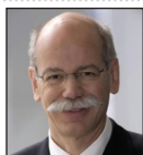
Daimler Dr. Dieter Zetsche