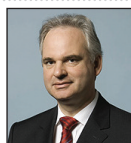
E.ON Dr. Johannes Teyssen