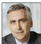
Siemens Peter Löscher