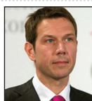
Deutsche Telekom René Obermann